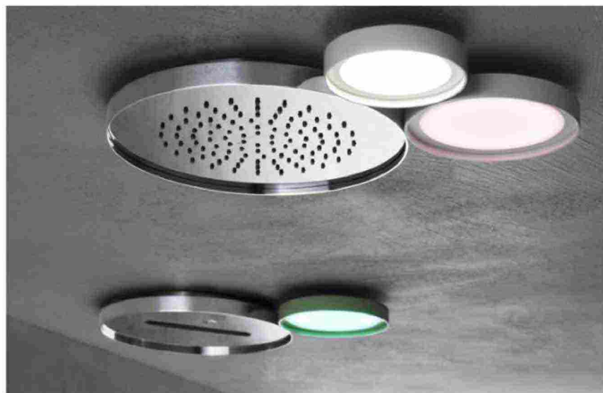
AQUAelite - Ninfea

Ninfea, Club, and Colonna 316: the new 100% Italian-made products AQUAelite will be exhibiting at Cersaie 2017; a synthesis of efficient manufacturing processes, waste reduction, and use of noble and recyclable materials.