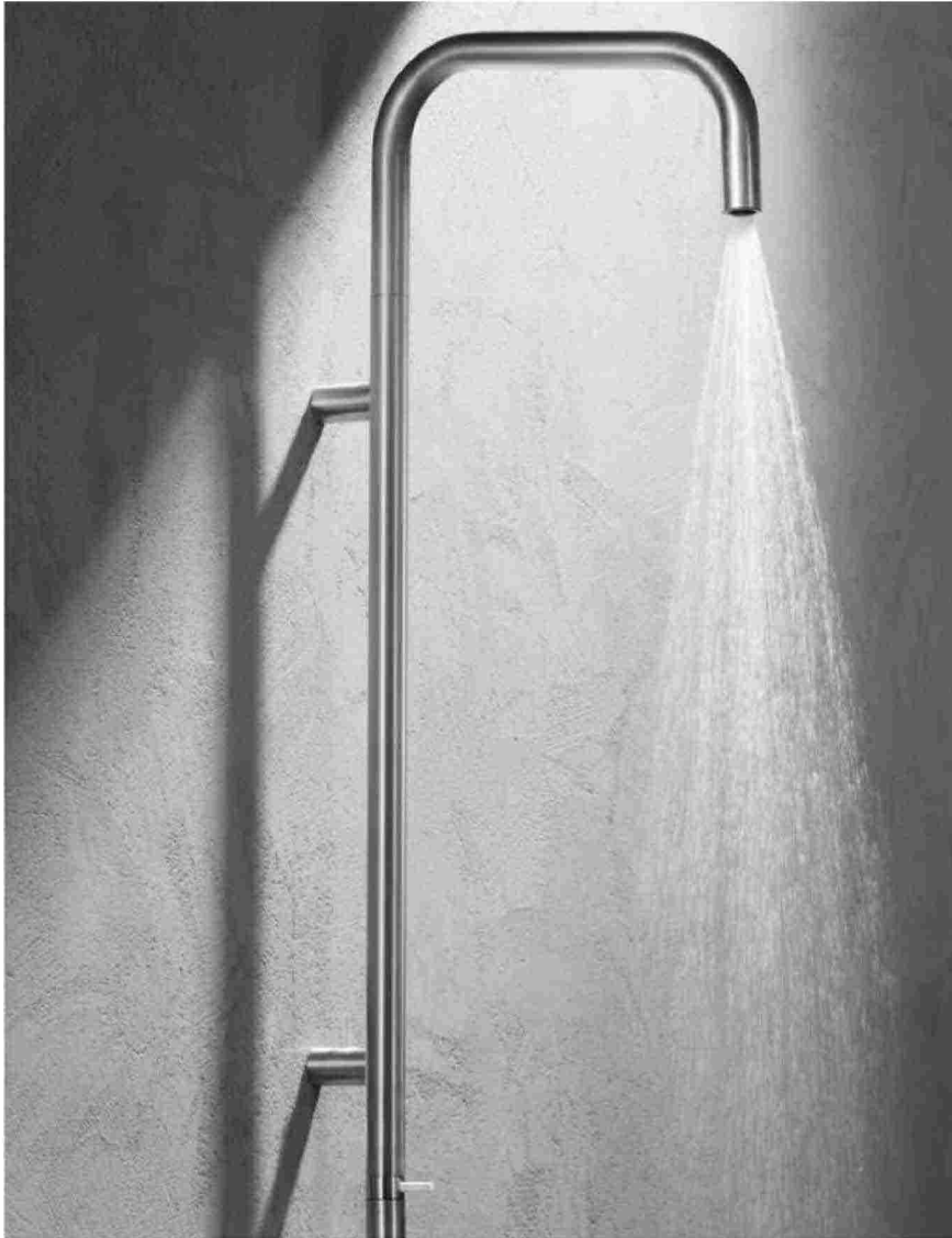
AQUAelite - Colonna: The missing component of the Metal collection, the Colonna is made from brushed 316 steel.

The continuous search for efficiency and water-saving solutions makes AQUAelite ® a very "green" brand, which is environmentally friendly and attentive to manufacturing efficiency. AQUAring, for example, is a water diffusion system which, combined with the particular design of the cartridges inside showerheads and showers and the use of flow control valves, enables products that dispense just 9L/min, ensuring high performance with reduced water use, while maintaining optimum comfort for the user.